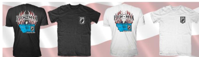
T-Shirt Available from vendor (see website)

Patches, t-shirts and ride information available Friday evening (14 Aug) and Saturday morning (15 Aug) before the ride.